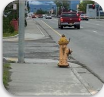
6th & Hyder