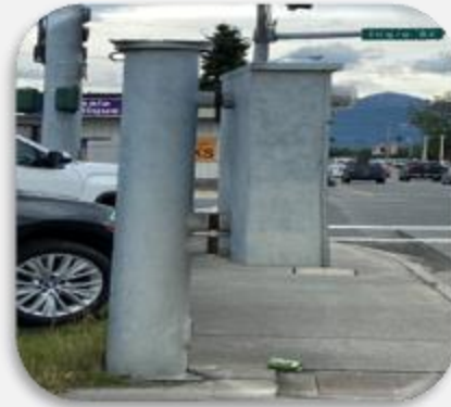
6th & Ingra