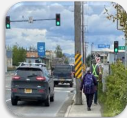
Gambell and 6th