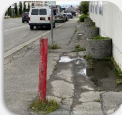
North side of 5th near Ingra