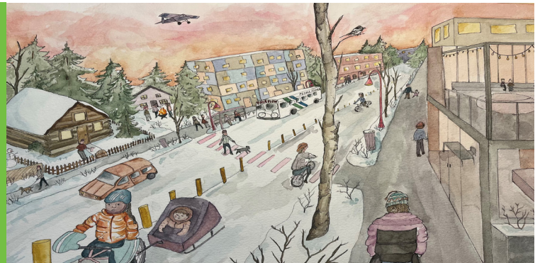
Painting of proposed Fairview Greenway along Hyder St.