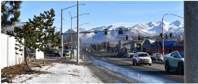
Eastbound view at 15th Ave. & Gambell St.